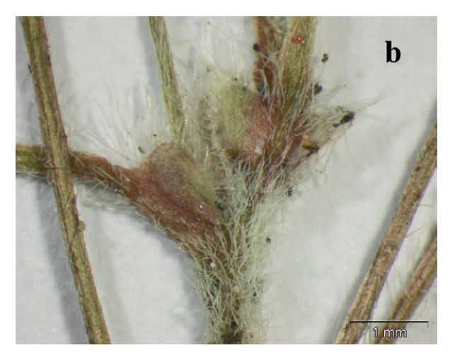
Figure 1. Detail of the stipules of Oxalis dillenii (A) and Oxalis corniculata (B). Both pictures are of dried herbarium material. The Oxalis dillenii photograph is from the Lleida material and the Oxalis corniculata is taken from plants collected in the Botanic Garden Meise, where it grows as a weed.